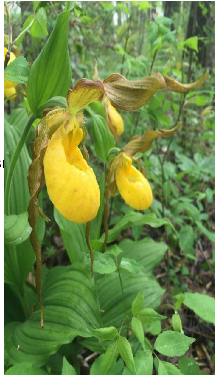
Cypripedium parviflorum var. pub