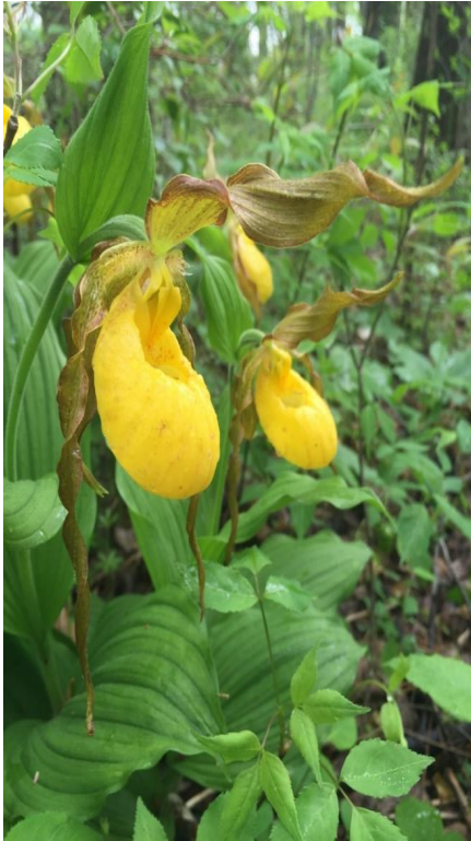
May 5, 2016