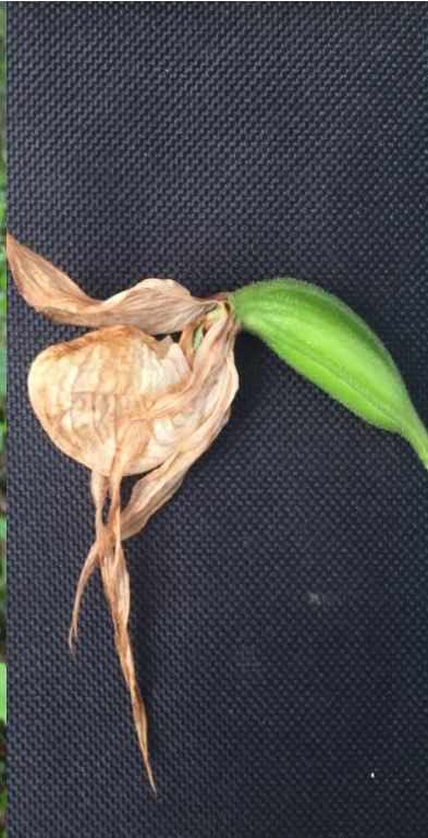
June 22, 2016