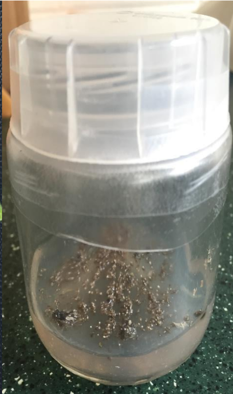
July 22, 2016