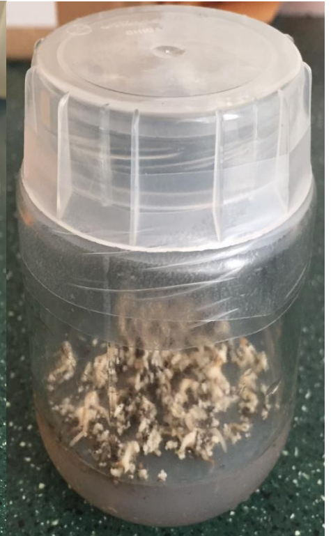
October 18, 2016